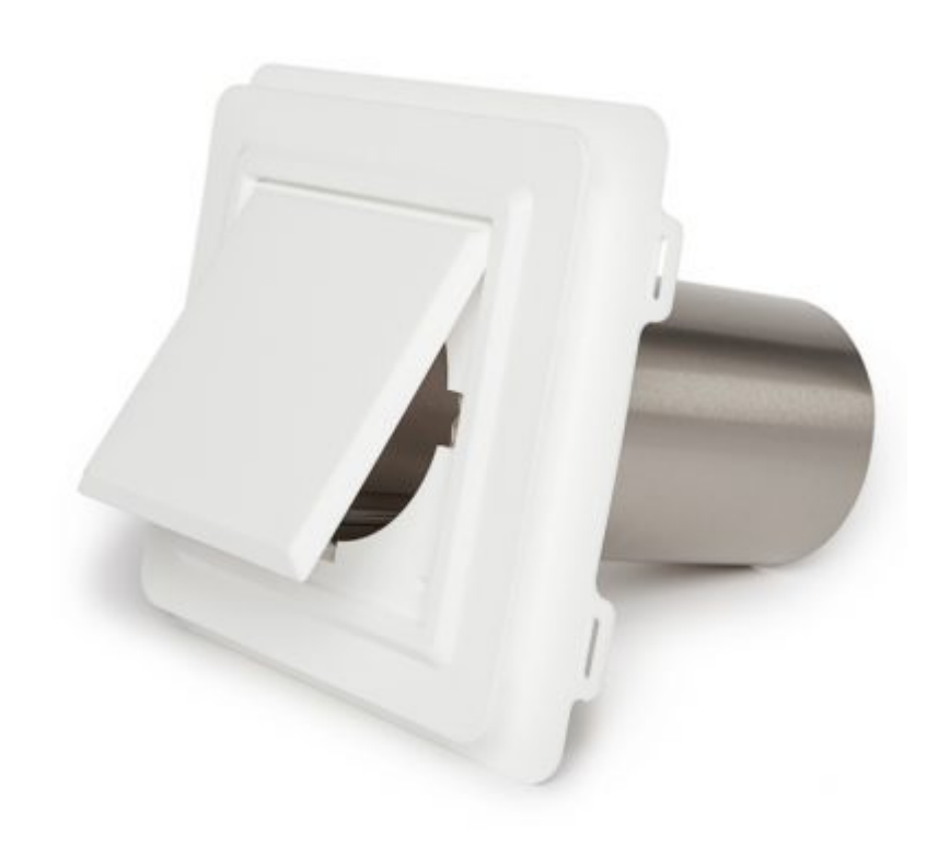
• Original Series Ventilation