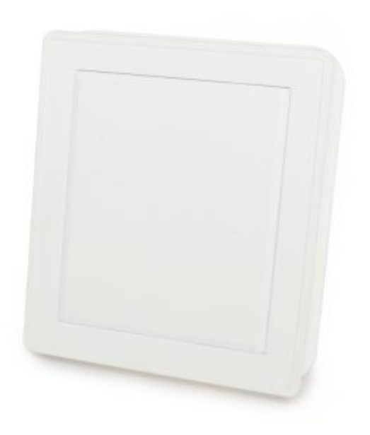
■ Third Wave Series